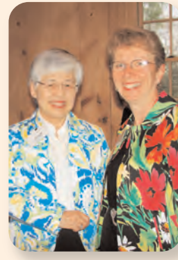
HopeWell will be holding its annual Wellwisher Reception this spring.

A SPECIAL CATEGORY FOR OUR MOST LOYAL DONORS