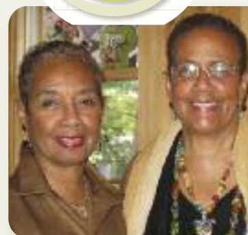
Join fellow WellWishers at an annual recognition event in the spring.